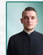
MYKOLA STEFANYK МИКОЛА СТЕФАНІК