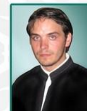
RIASAPHOR MONK POLISCAR РІАСАФОРНИЙ МОНАХ ПОЛІСКАР