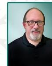
BRIAN DELP БРАЯН ДЕЛП