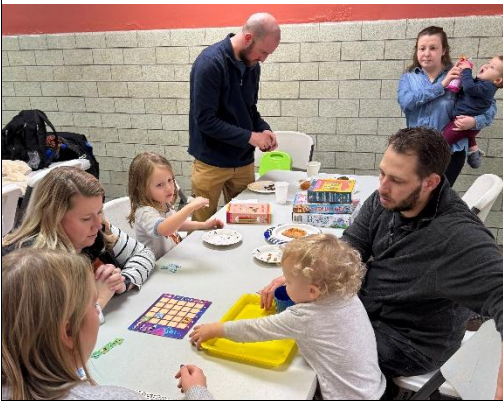
Family Game Night